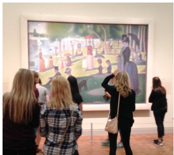
The Art Institute